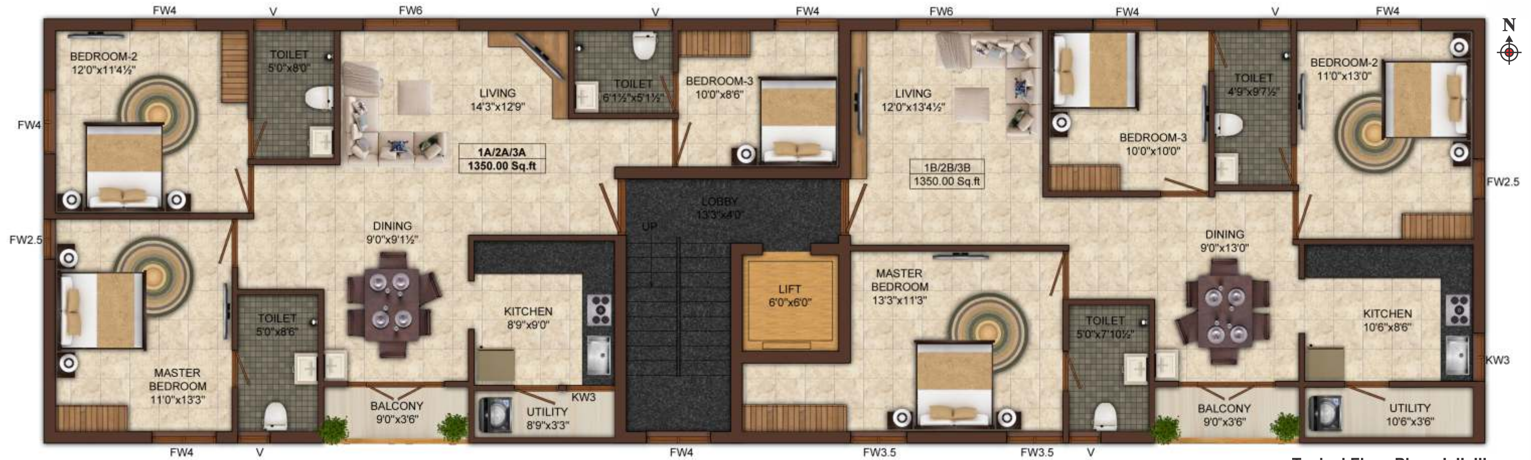
Typical Floor Plan - I, II, III